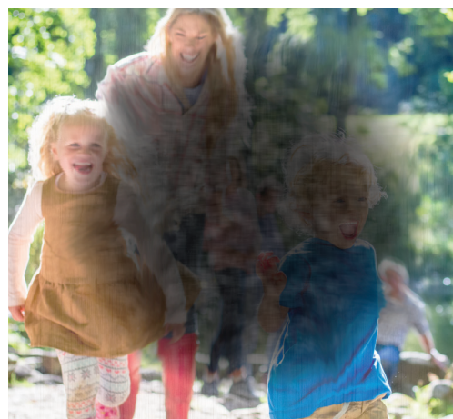
Vision with advanced AMD